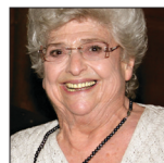
CLAIRE RAYNER President of the Patients Association