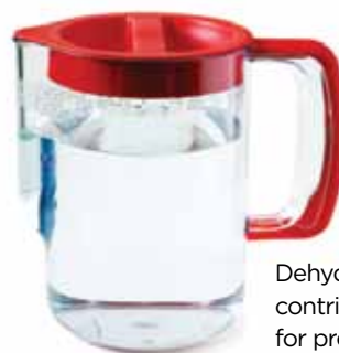
Dehydration is a contributing factor for pressure ulcers

5 Education for all involved and effective communication throughout underpin the principles of successful fluid management